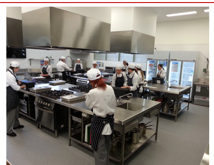
Pictured above is our Year 12 Hospitality Class who have just been given a 'Mystery Box' to work with for their practical lesson!