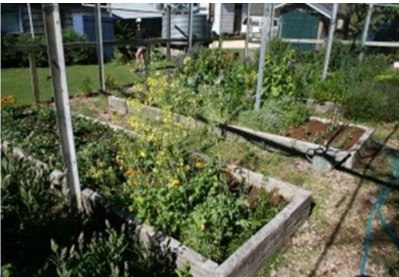
Left: 'Education Hothouse'